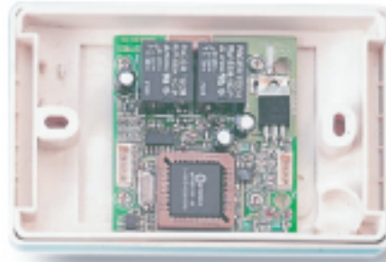
... ↪ MDDIDO - 15